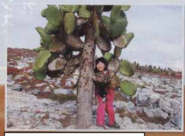
With a famous cactus, Galapagos Islands