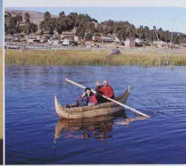
In Lake Titicaca, she had a ride in a reed boat