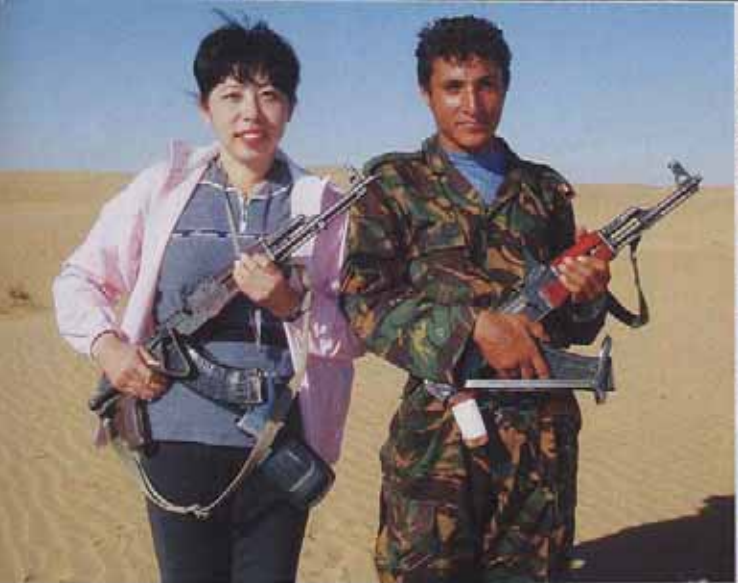
Automatic rifles are the necessities in Yemen