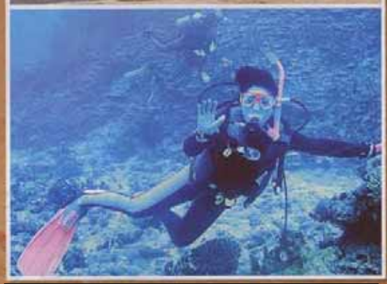
Dived into the sea, with beautiful corals in Saipan