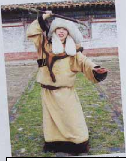
She completely transformed into Jinghis Khan

In April this year, she visited Afghanistan crossing the boarder from Pakistan and then stood at the front of Bamiyan ruin. It is often said to be dangerous to travel to Afghanistan (by crossing the boarder from Pakistan by car), but I made inquiries a number of times to authorities of both countries, developed a plan very carefully and decided not to use a taxi when crossing the boarder and to have a solider with me when crossing tribal areas. I have no intention to criticize a hostage crisis in Iraq, but it is a commonsense of the world to make every possible effort to avoid risks and dangers of our own. Her next destinations are to see the Titanic that sank to the bottom of the sea and to fly through the stratosphere (the suborbital flight) to see the earth.